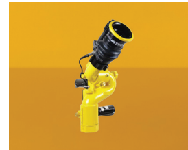
Environmentally sealed nozzle capable of 90 degree fog or straight stream pattern