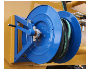
Hose Reel: COXREELS: One-piece, all CNC robotically welded steel "A" frame construction; custom design for Premier Tanks