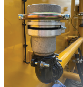
Spray head: Reliable, heavy-duty, 3" Premier Spray Head