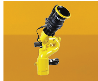
Environmentally sealed nozzle capable of 90 degree fog or straight stream pattern