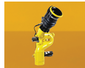
Environmentally sealed nozzle capable of 90 degree fog or straight stream pattern